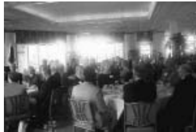
Luncheon In Progress

Chapter officers and executive committee members were elected during the business portion of the meeting. In addition, the recent events video debuted at the Society's Annual Meeting in Philadelphia, was available for the Chapter's membership to view the past year's events of the Society and the Lancaster Chapter.