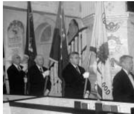
2002 Annual Church Service