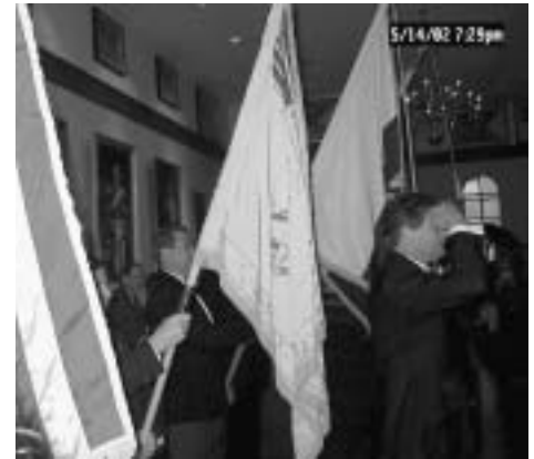
"Salute to First City Troop"