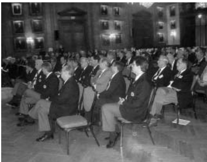
2002 Annual Meeting Attendees