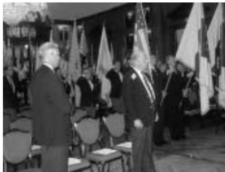
2002 Annual Meeting

"Almighty God, and most merciful Father...since Thou art a God of pure eyes, and wilt be sanctified in all who draw near unto Thee, who dost not regard the sacrifice of fools, nor hear sinners who tread in Thy courts, pardon, I beseech Thee, my remove them from Thy presence, as far as the east is from the west, and accept me for the merits of Thy son, Jesus Christ; that when I come into Thy temple and compass Thine altar, my prayer may come before Thee as incense; and as Thou wouldst hear me calling upon Thee in my prayers and give me grace to hear Thee calling on me in Thy Word, that it may be wisdom, righteousness, reconciliation, and peace to the saving of my soul in the day of the Lord Jesus Christ."