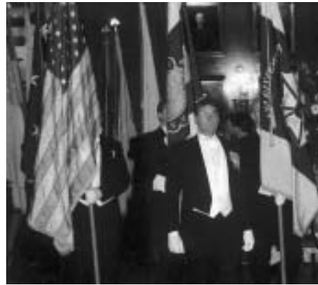
"First Call to Duty"