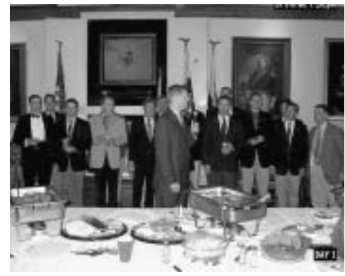
First City Troop Prepare for Deployment