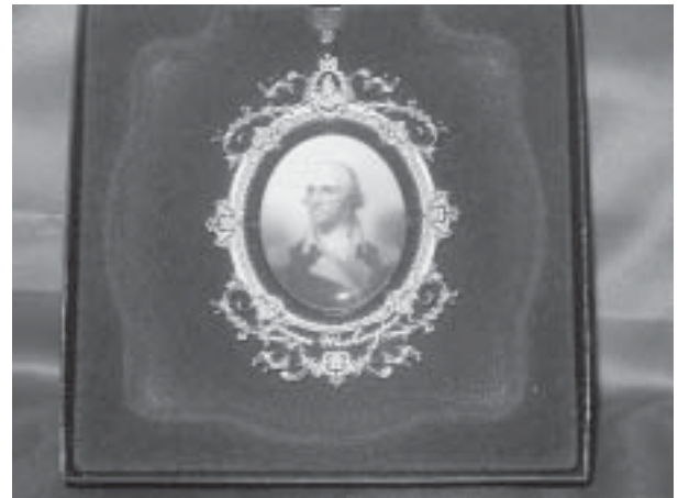
"George Washington Commemorative Ornament" designed from the Rembrandt Peale portrait of Washington

Then came the delivery day and 250 ornaments were delivered and