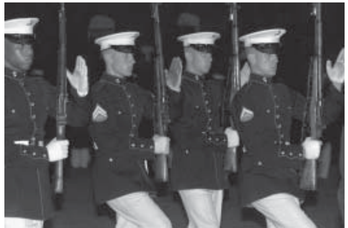
Marine Silent Drill Team