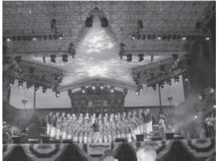
Philadelphia Boy's Choir

For the first time, there will be simultaneous bell ringing ceremonies across the state in Philadelphia and Harrisburg sponsored by the First City Troop, as well as one sponsored in Pittsburgh by the Sons.