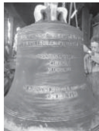
Normandy Liberty Bell

The Society looks forward to the new Let Freedom Ring website being more user friendly and allowing all related ceremonies to reach their full potential.