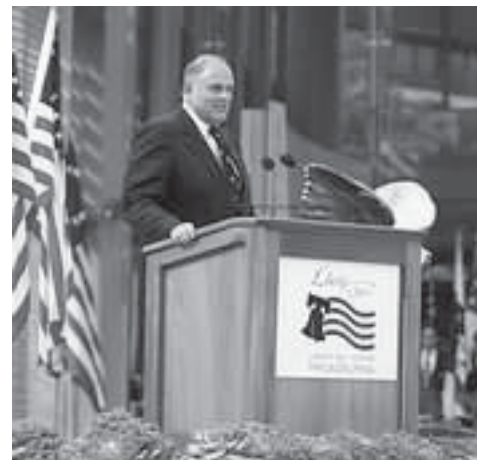
Governor Ed Rendell