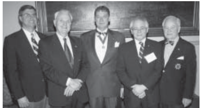
The PSSR Color Guard