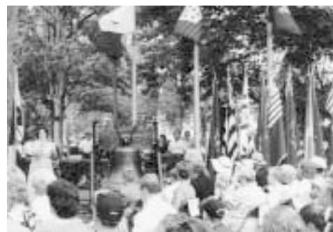
Attendees watch the Let Freedom Ring Ceremony