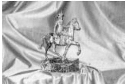
"General Anthony Wayne" Statue Debuted At Reception