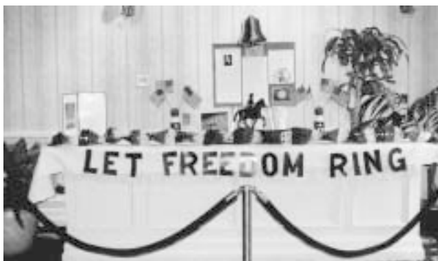
Independence Day Reception debuted U.S. President's letter, Proclamations, new Let Freedom Ring t-shirt, and the newly completed Anthony Wayne statue in miniature