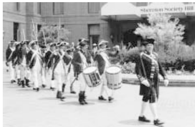
Second Pennsylvania Regiment ready to lead the group to the ceremony