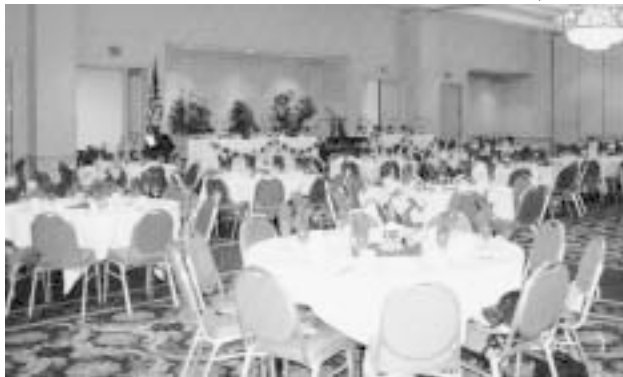
"The Room Is Ready For The Independence Day Luncheon"