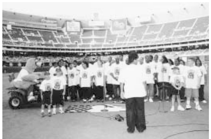
HERE COMES THAT PHILLY PHANATIC!!!

The Phillies introduced this year's bell tappers to the crowd while the TR Malone Gospel Choir sang the National Anthem during the pre-game activities on July 3rd; all are wearing the new Let Freedom Ring T-shirts available through the Society website.