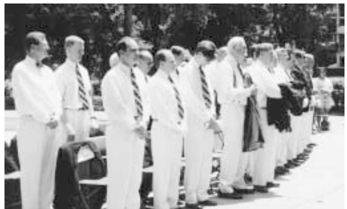
A Special "Thank You" To The PSSR Color Guard