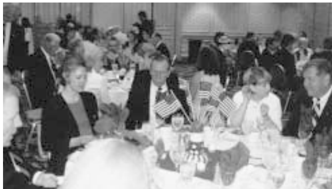
Over 225 members, guests, and children enjoyed the Independence Day Luncheon held at the Society Hill Sheraton in Philadelphia