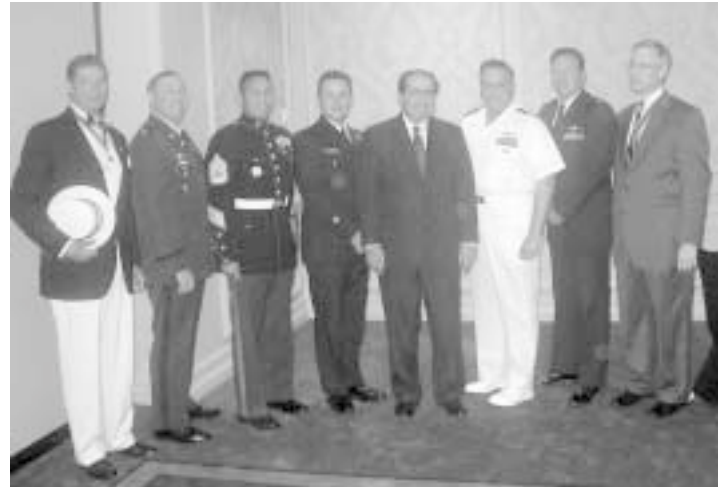
"Operation Tribute to Freedom"