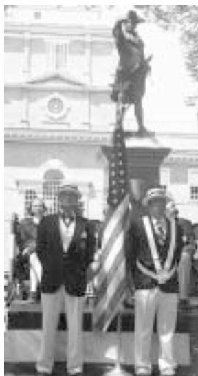
"A Handsome Pair"