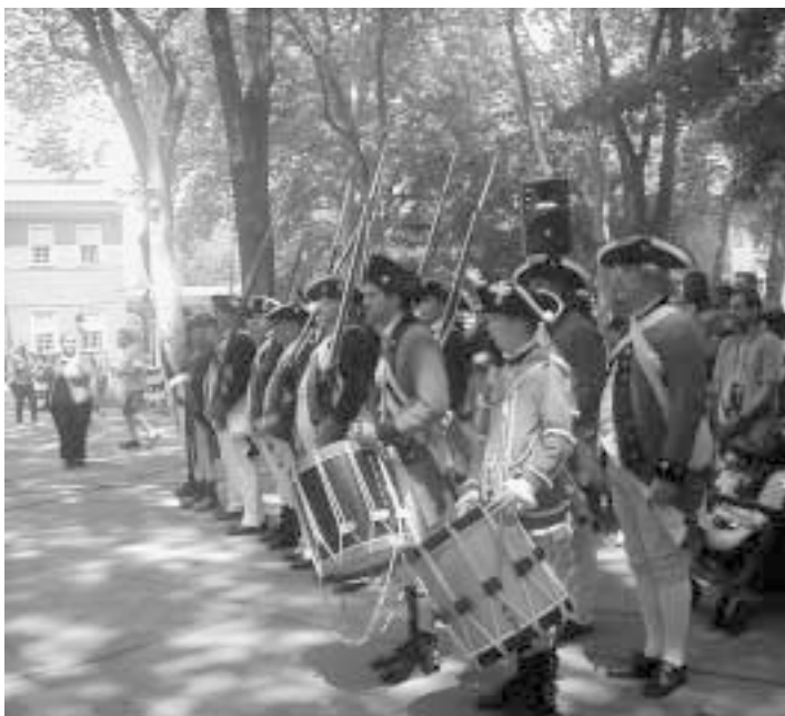
Second Pennsylvania Regiment Many years and many thank you's for their Let Freedom Ring participation