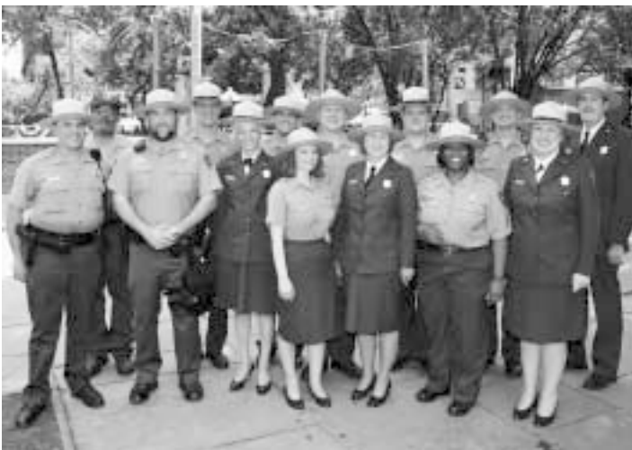
INHP Staff Thank you for 35 years of service and dedication to Let Freedom Ring