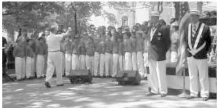
World Famous Philadelphia Boys' Choir