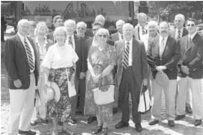
Lancaster Chapter attends Let Freedom Ring