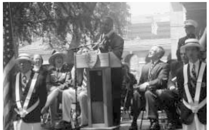
Philadelphia Mayor John Street greets Let Freedom Ring audience