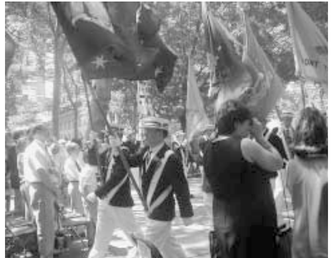
"The Colors Proudly Waving At the Close of the Ceremony"