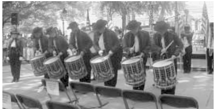
American Originals Fife and Drum Corp