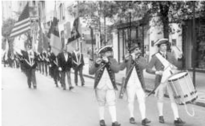
PA Regiment Leading the Color Guard to the Triennial Church Service