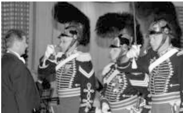
Flag Returns Home to PSSR First City Troop returns flag sent to Bosnia