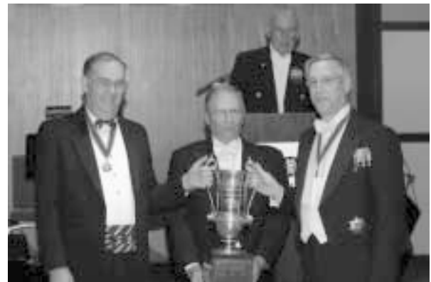
Trent Trophy New York and Pennsylvania Tied