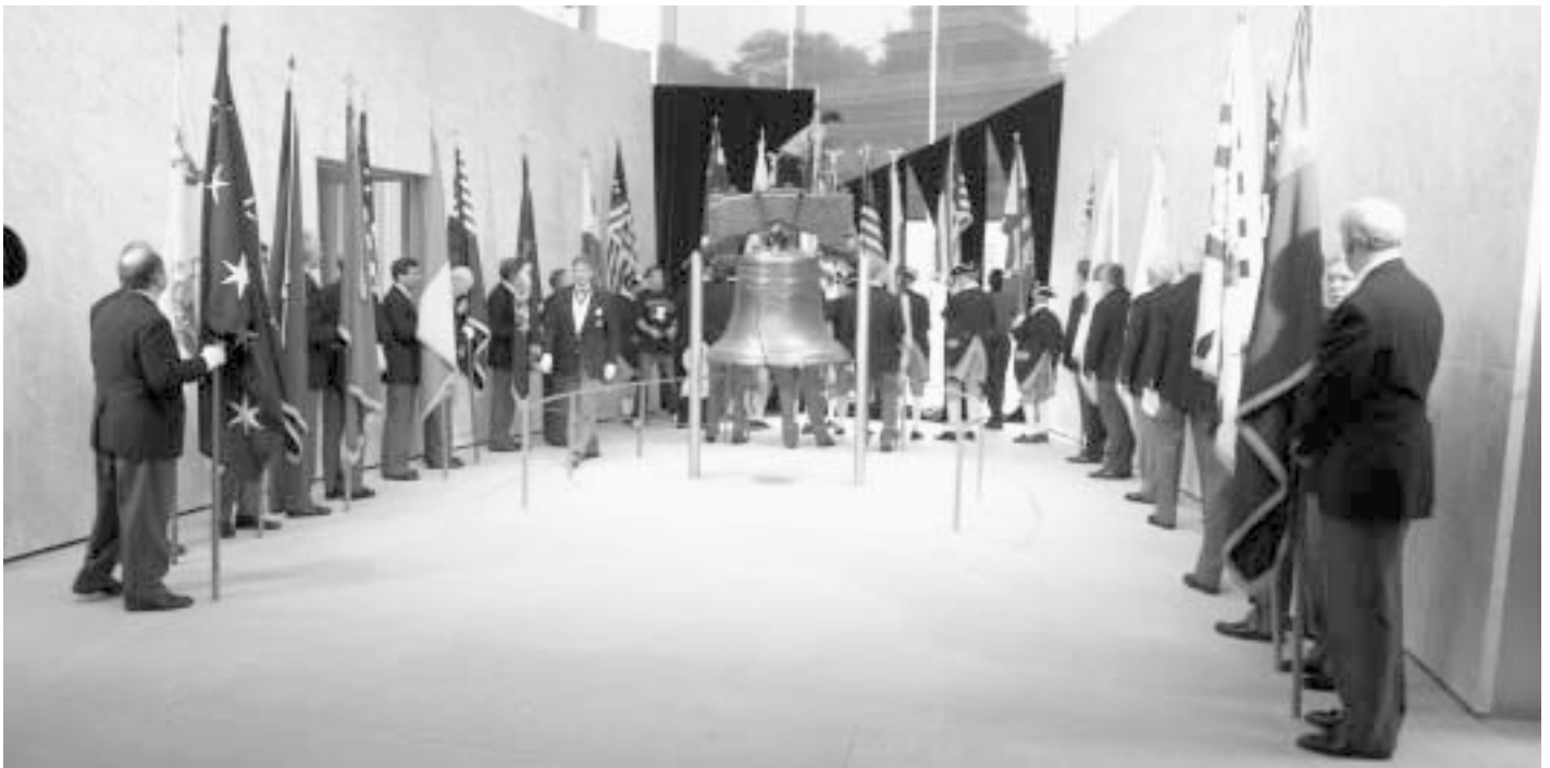
The Color Guard

Through the years the Society and the Color Guard have been involved in the Liberty Bell's history in one aspect or another. The Color Guard was deeply honored to be part of the Liberty Bell's move to its new home on October 9th, 2003, in yet another historic moment in the Guard's history and the Bell's.