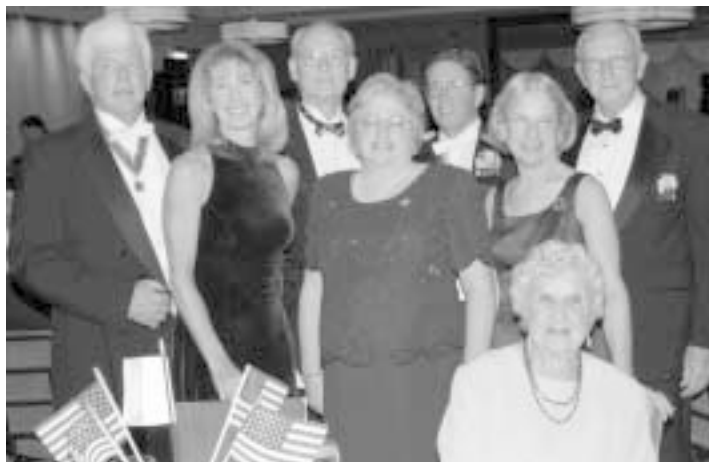
Other State Members, Wives, and Guests Enjoying the Ball