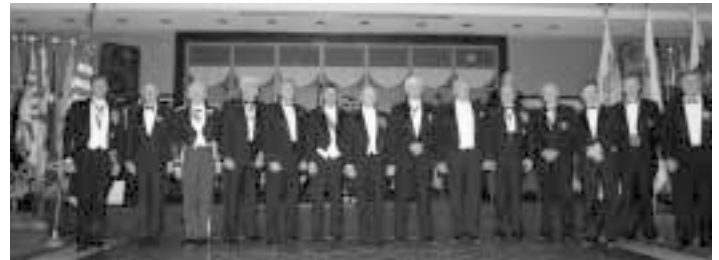
Newly Sworn In General Society Representatives