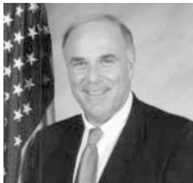
2004 Let Freedom Ring National Spokesman

The Triennial Ball attendees were surprised when Governor Ed Rendell of Pennsylvania walked in to pay a visit to the states assembled for the night's festivities. As the Society knows, Governor Rendell has been an avid supporter of Let Freedom Ring for many years, and he conveyed his appreciation to the PA Society when he addressed the audience present at the Triennial and encouraged others to take part in the 2004 ceremony.