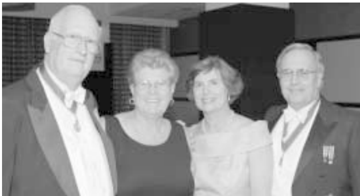
The Dutchers and the Maidens at the Triennial Ball