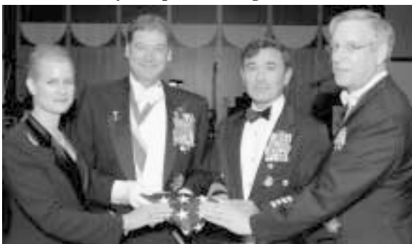
Flag Immediately Leaves PSSR to Bahrain