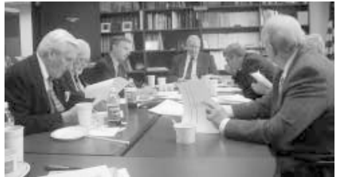
In the beginning..... Triennial Committee