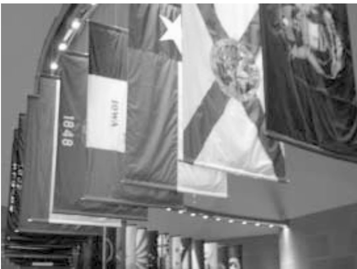
Flags Hanging At National Constitution Center