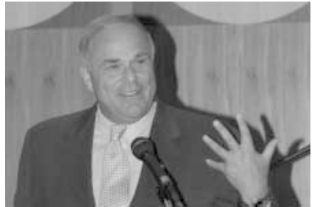
Visit from the Governor Edward G. Rendell