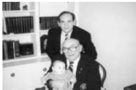
"Three Generations of Wards"