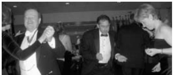
Members enjoy fun evening at 2001 Musket Ball