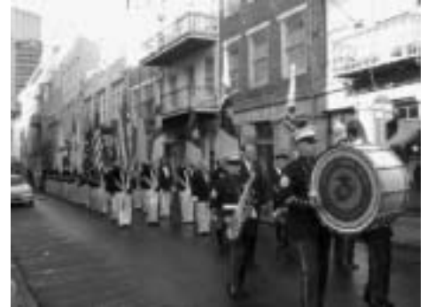
New Orleans Triennial