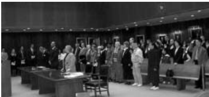
New Citizens sworn in at Philadelphia Ceremonial Courtroom