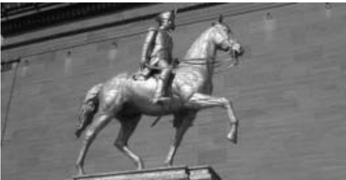
Anthony Wayne Statue Refurbished Philadelphia Art Museum