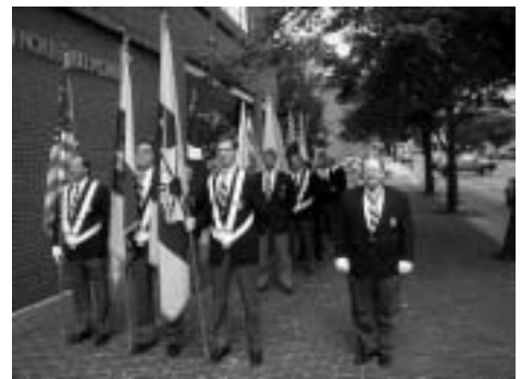
Getting ready to dedicate a flagpole!