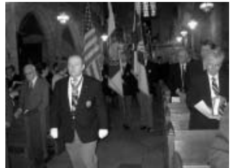
2001 Annual Church Service