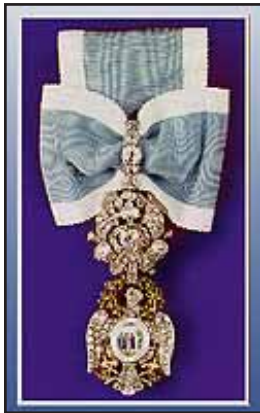
The Cincinnati Diamond Eagle

The year 2009 will mark the 277th birthday of our first President. Invitations have already been mailed. We encourage you to send in your response card immediately. You may also call the P.S.S.R. office at 215-545- 1888 to reserve.