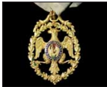
The Washington-Lafayette Eagle